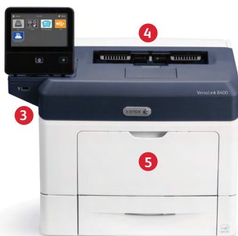
Xerox® VersaLink® B400 Printer Print.

This unmatched balance of hardware technology and software capability helps everyone who interacts with the VersaLink® B400 Printer or VersaLink® B405 Multifunction Printer get more work done, faster.