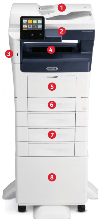
Xerox® VersaLink® B405 Multifunction Printer Print. Copy. Scan. Fax. Email.