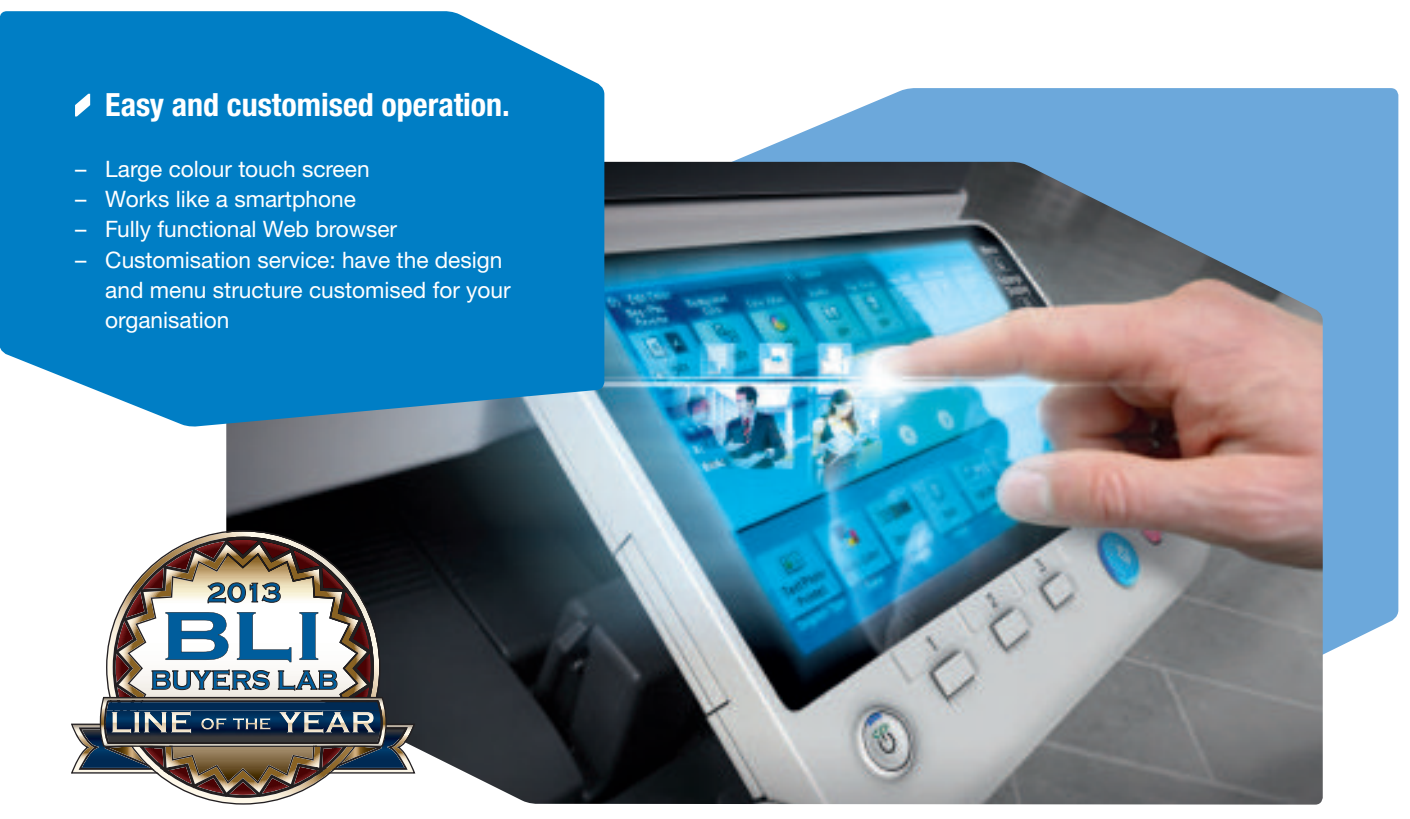
Our bizhub multifunctionals were named the product line of the year in 2011, 2012 and 2013.

We offer a wide range of professional finishing functions, the likes of which you won't find anywhere else: from stapling and folding right through to brochures that are ready to go. A practical solution for handouts, direct mailings or customer leaflets.