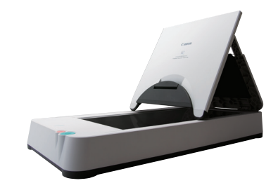
A4 Flatbed Scanner Unit 101