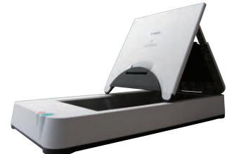
A4 Flatbed Scanner Unit 101