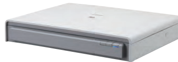
A3 Flatbed Scanner Unit 201

Scan bound books, journals and fragile media by adding the Flatbed Scanner Unit 101 for documents up to A4 or Flatbed Scanner Unit 201 for A3 scanning. Connected by USB, these flatbed scanners work seamlessly with the DR-M140 in a smooth dual-scanning operation that lets you apply the same image enhancement features to any scan.